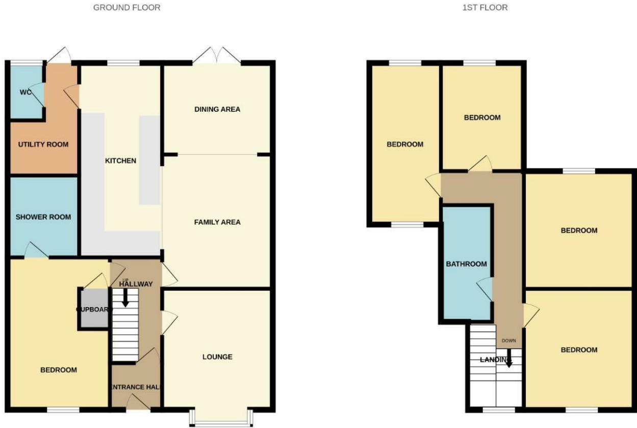
FIVE BEDROOM DETACHED

Whilst every attempt has been made to ensure the accuracy of the floorplan contained here, measurements of doors, windows, rooms and any other items are approximate and no responsibility is taken for any error, omission or mis-statement. This plan is for illustrative purposes only and should be used as such by any prospective purchaser. The services, systems and appliances shown have not been tested and no guarantee as to their operability or efficiency can be given. Made with Metropix ©2026